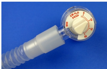
Integral PEEP Valve, 4 – 20 cmH 2 O