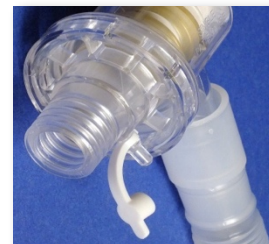
Monitoring Port with Tethered Cap