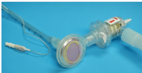
Also Available with CO 2 Easy™ Exhaled CO 2 Detector